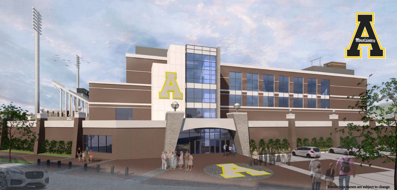
Renderings shown are subject to change.