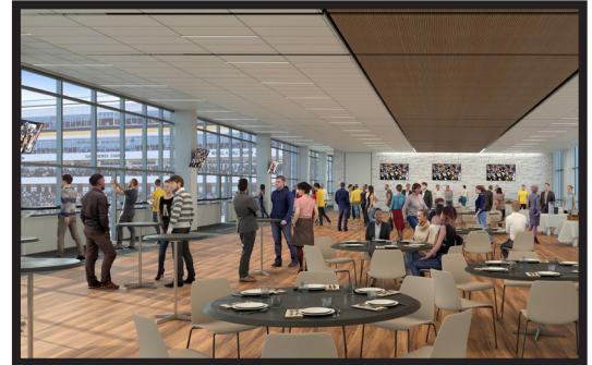
Renderings shown are subject to change.