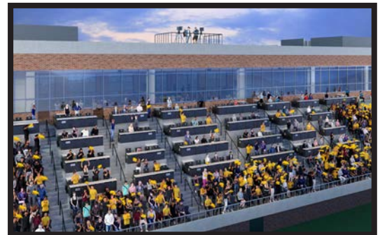
Renderings shown are subject to change.

For more information, please visit www.mountaineerimpact.com or contact the Yosef Club office at 828-262-3108